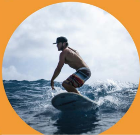
Find a hobby

Animal shelter Senior living Food pantry