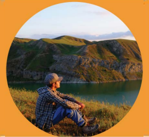
Spend time in nature