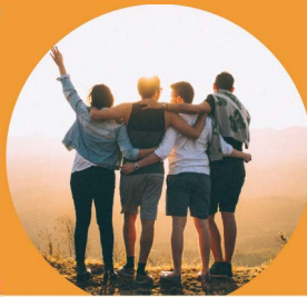
Hang out with friends

Go to the park Watch a movie Have a game night